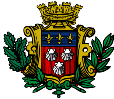
Bougainville Flag and Coat of Arms